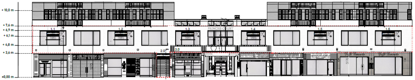
Proposed Front (Brompton Road) Elevation