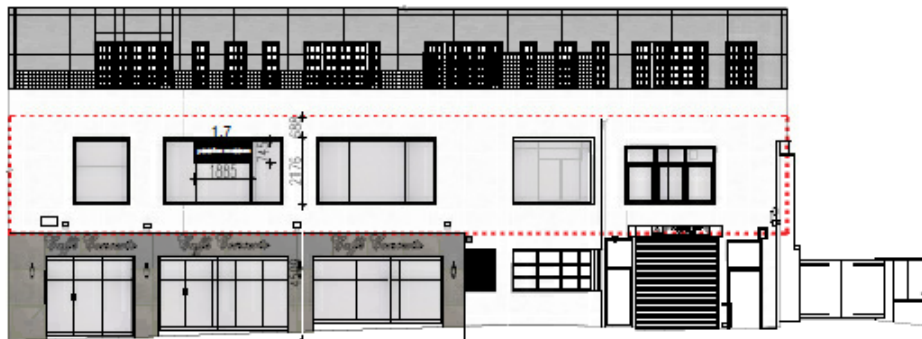
Proposed Side (Lancelot Place) Elevation