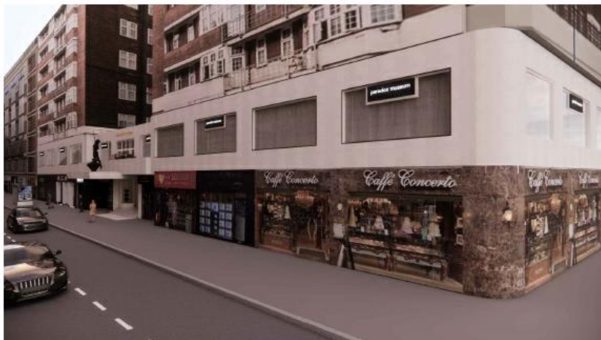
BROMPTON ROAD - LANCELOT PLACE