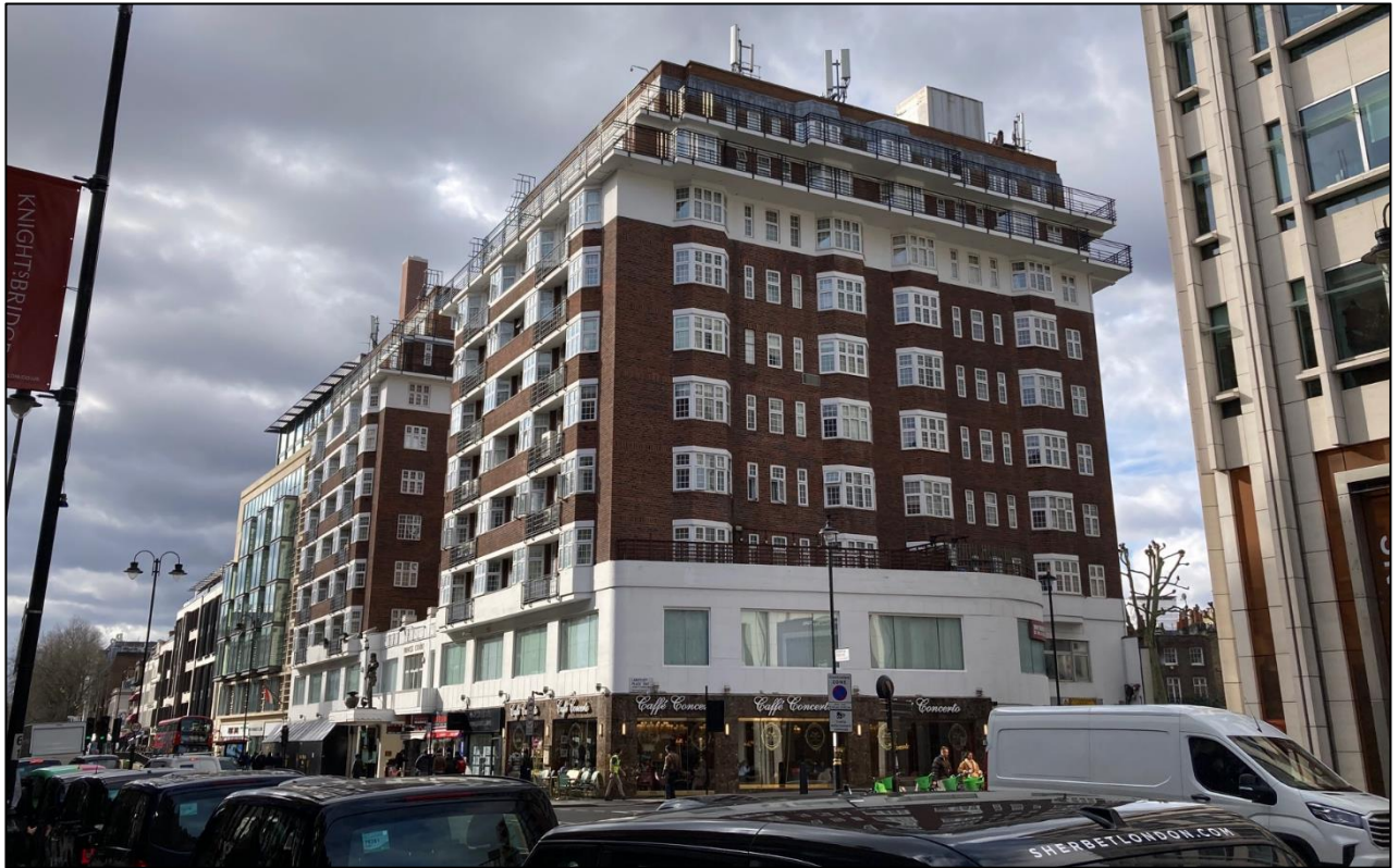
The application site (Princes Court) as seen from the corner of Hans Crescent and Brompton Road