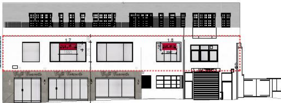
Pre-Existing Side (Lancelot Place) Elevation